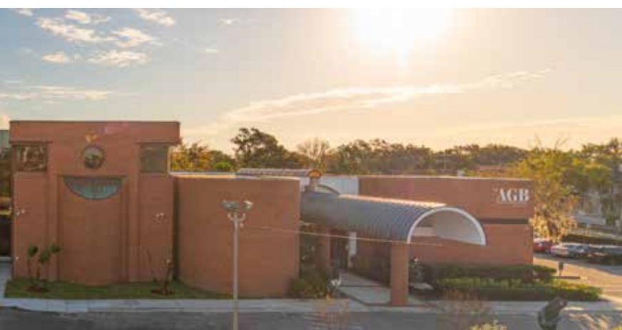
The Ashley Gibson Barnett Museum of Art at Florida Southern College.