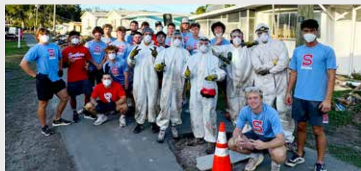
Baseball poses for a photo at the Light & Life Park in the fall of 2024 as the Mocs gave back to the community hit hard by Hurricane Milton.

Florida Southern was joined by Barry University, Eckerd College, Florida Institute of Technology, Lynn University and Rollins College as SSC institutions on the 2024 list. Only the Northeast-10 Conference, Sunshine State Conference, and Central Atlantic Collegiate Conference boast five or more athletics programs with ASRs of 90 percent or higher. The NCAA also announced that SSC member institutions combined for an ASR of 90 percent, setting the league's all-time high. The mark places the SSC first among the 23 Division II leagues for the second year in a row.