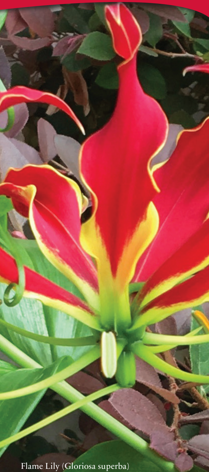
Flame Lily ( Gloriosa superba )