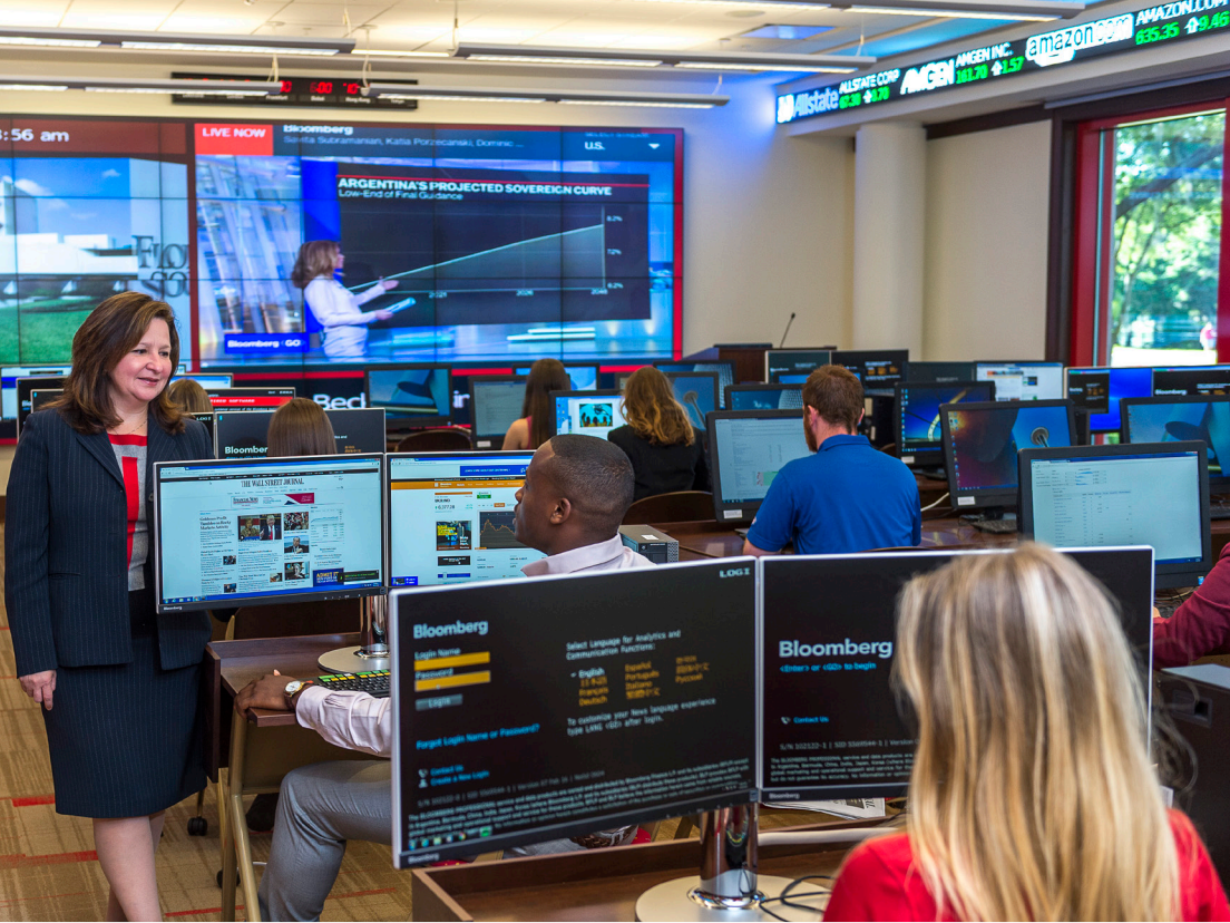
▲ The Becker Business Building is a state-of-the-art 45,000-square-foot facility equipped with the technology to train business leaders of tomorrow.