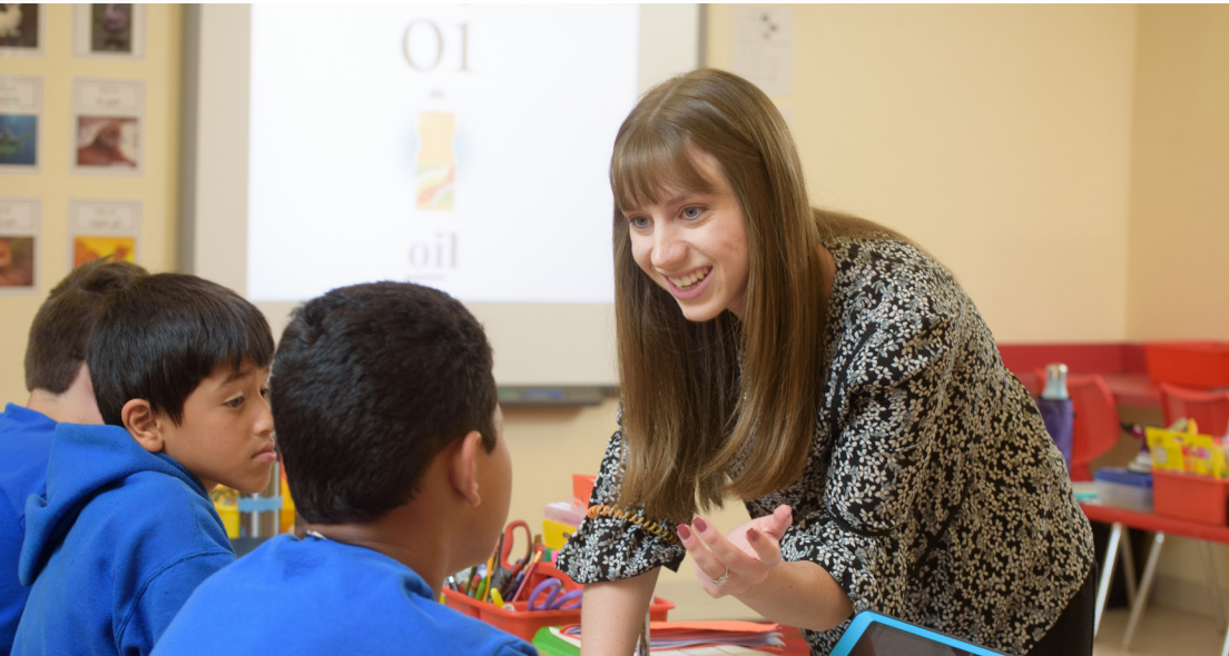
▲ Florida Southern is the only program in the state that integrates SMART technology within the classroom in every education course.